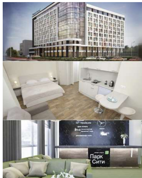
📍 “PACK CITY HOTEL” 40B, Partizana Zhelezyaka