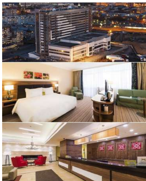
📍 “HILTON GARDEN INN” 37, Molokova Street