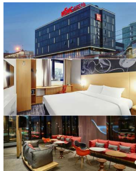
📍 “IBIS HOTEL” 123, Karla Marksa Street